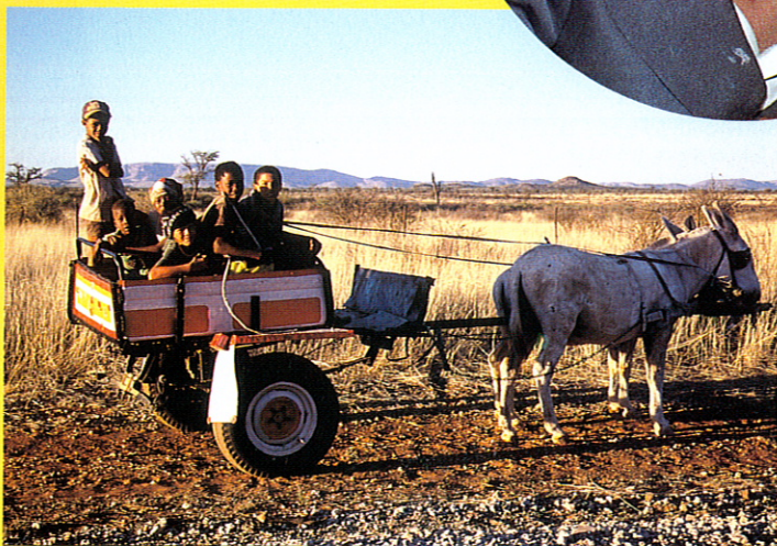
Most of the ROSL Bursary recipients come from isolated communities as pictured here en-route to Mokaleng. This 'tyranny of distance' requires most local schools to be residential.