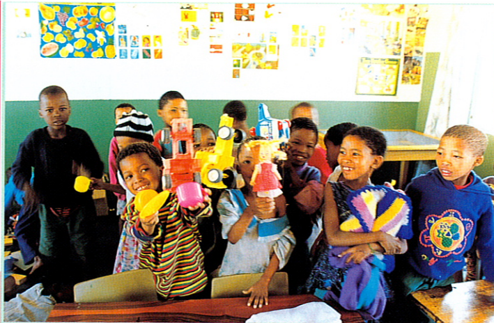
With help from local farmers who arranged transport, pre-school bridging classes for children speaking a variety of San (Bushman) dialects were introduced at Qgaina School in January

Highlights of 1997 included the achievements of the Bursary recipients; the organisation of the first National Gathering for San speaking pupils by the Ministry of Education; donations in cash or in kind from ROSL branches and members, Air Namibia and Dorling Kindersley; sufficient funds to support ten more youngsters in the Omaheka