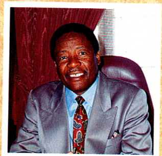
Amongst those welcoming closer links with the League, Dr M P Tjitendero, Speaker of Namibia's National Assembly.

The League would like to thank all those who donated items or funds and thereby helped take forward these informal friendship projects.