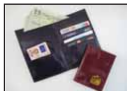
Small wallet and credit card holder