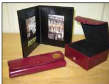
Double photo frame, square travel jewellery box and hard spectacle case